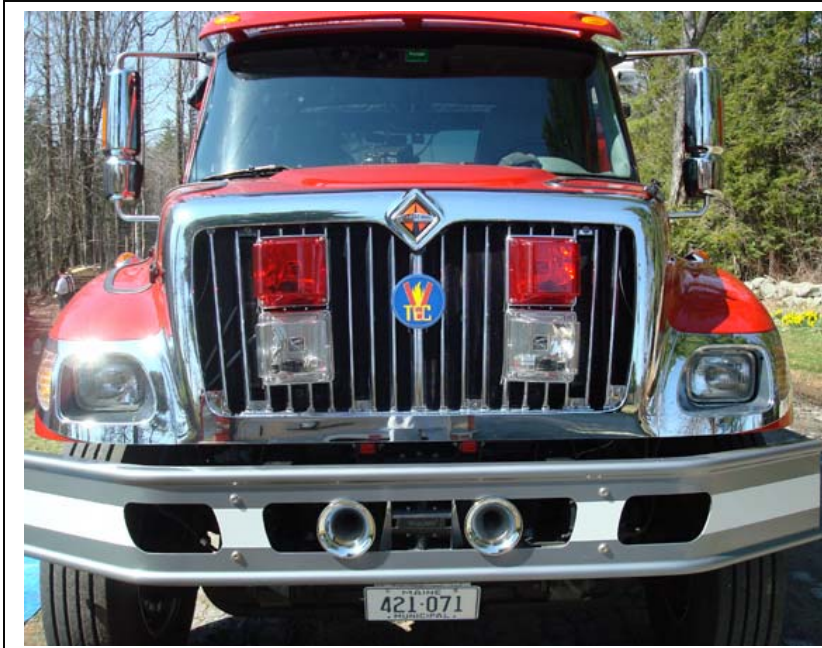
The brand new Waterford fire truck at the scene of raging fire.

The sunny, warm and slightly windy day was welcomed as numerous families sat in lounge chairs and enjoyed the “show.” Children played in the streams of water running down the street. As the fire roared on, the “firefighters” were more intent on saving nearby trees than the building.