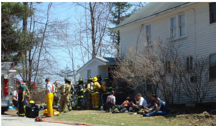
Fire safety personnel gather and discuss fire fighting procedures prior to the outbreak of suspicious fire that destroyed Waterford building on Apple Blossom Lane.