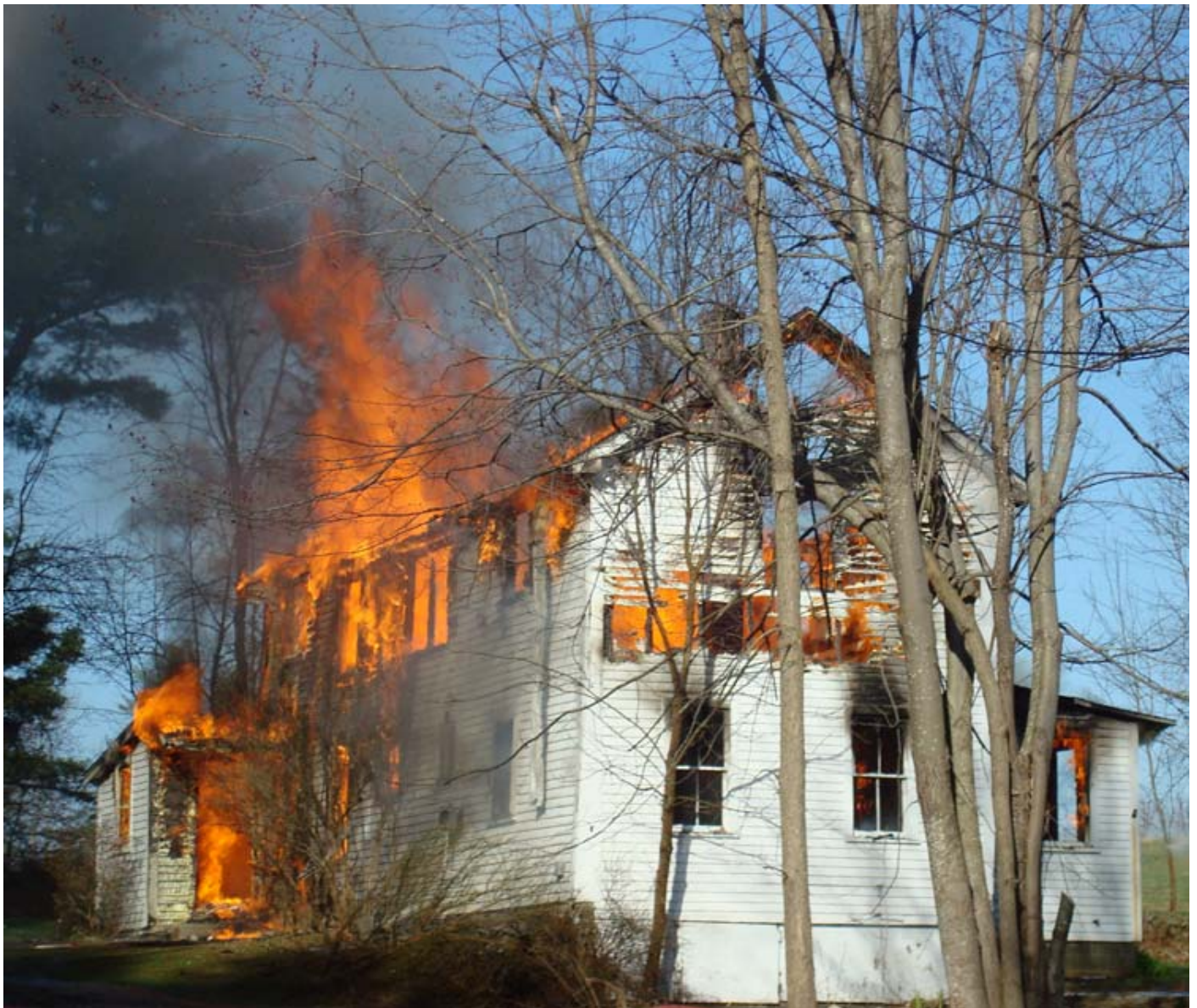
Suspicious fire destroys building at 14 Apple Blossom Lane. It was a total loss.

WATERFORD, Maine – A raging fire turned the former Apple Blossom Lane home of Doris McAllister, 90, and Carroll Fogg, 94, to a pile of ashes on April 25 as numerous public safety personnel looked on. The “firefighters” had difficulty pointing their hoses straight at the fire and appeared to be gleefully enjoying themselves.